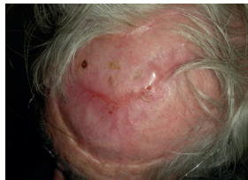
DAY 92 Complete wound closure with a good cosmetic outcome