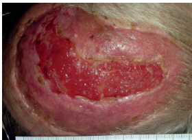
DAY 30 Wound/exposed bone completely covered with granulation tissue