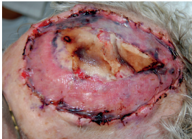
DAY 1 Treatment start after skin graft failed to take

86-year-old female with a 22cm 2 scalp wound with 15.2 cm 2 of exposed bone.