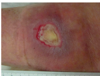
DAY 1 Start treatment with ①